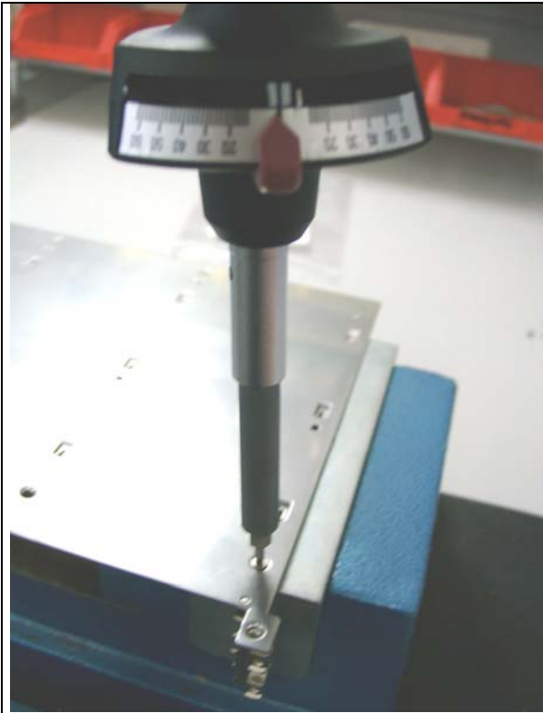
Photo 3= Trial with die-cast strut part no.: 60849-023. Measurement performed with STAHLWILLE torque tester.