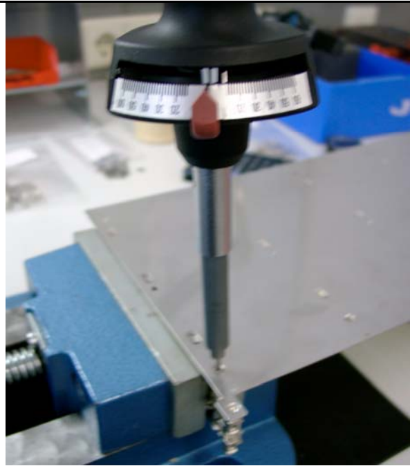
Photo 2= Trial with die-cast strut part no.: 60849-022. Measurement performed with STAHLWILLE torque tester.