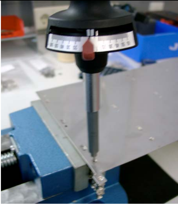
Photo 2= Trial with die-cast strut part no.: 60849-022. Measurement performed with STAHLWILLE torque tester.